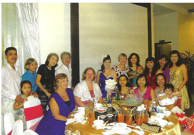
Celebrating a class members wedding