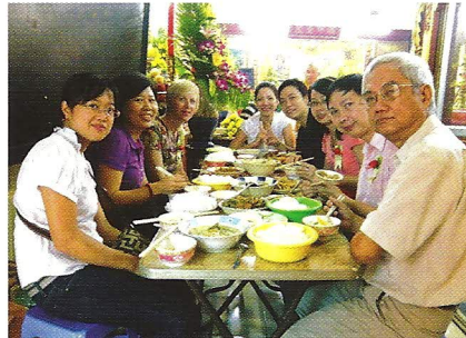
With work colleagues celebrating Parents Day

Clinical Education component of the program. It is fabulous that there are now 2 of us "on the ground", not only sharing and developing ideas, but also sharing the experience of living in HCMC. For it would be fair to say that at times living and working in HCMC is challenging... rewarding yes! ...but also challenging... and to have collegial support and friendship is wonderful.