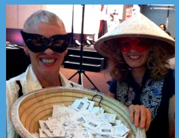
TFA Booth at SPA Conference and Raffle Draw

Trinh Foundation Australia is proud to be a partner for Project J594 Vietnam Speech-Language Program with Global Development Group. GDG (ABN 57 102 400 993), an Australian DFAT approved Non-Government Organisation [NGO] carrying out quality humanitarian projects with approved partners.